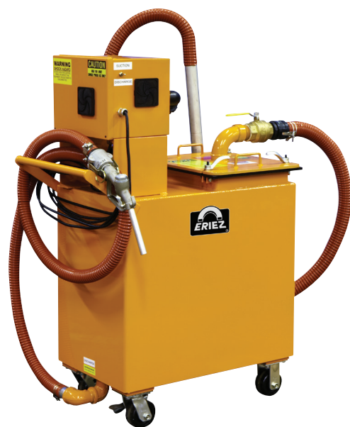
Eriez 50 Gallon (189 L) Sump Cleaner

would use an air pump for the liquid, then shovel and scoop out the chips and fines by hand, and finally wipe out the tanks with rags.