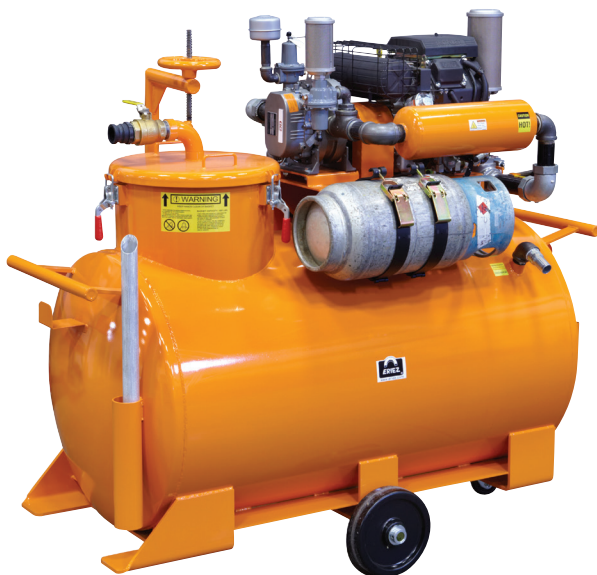
Eriez LP Gas Sump Cleaner