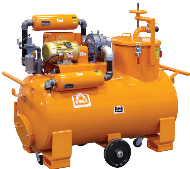
Eriez Electric Sump Cleaner