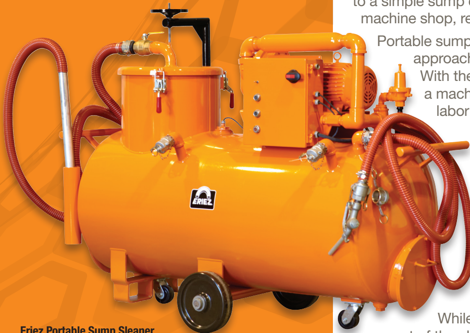
Eriez Portable Sump Cleaner

Removing solids from coolant in the machining process is critical to achieving better fluid performance and longevity, air quality, bacterial resistance, corrosion resistance, tool life and parts finish. Advanced portable sump cleaners can provide the solution.