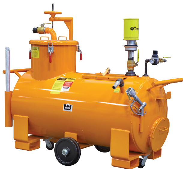
Eriez Air Venturi Sump Cleaner